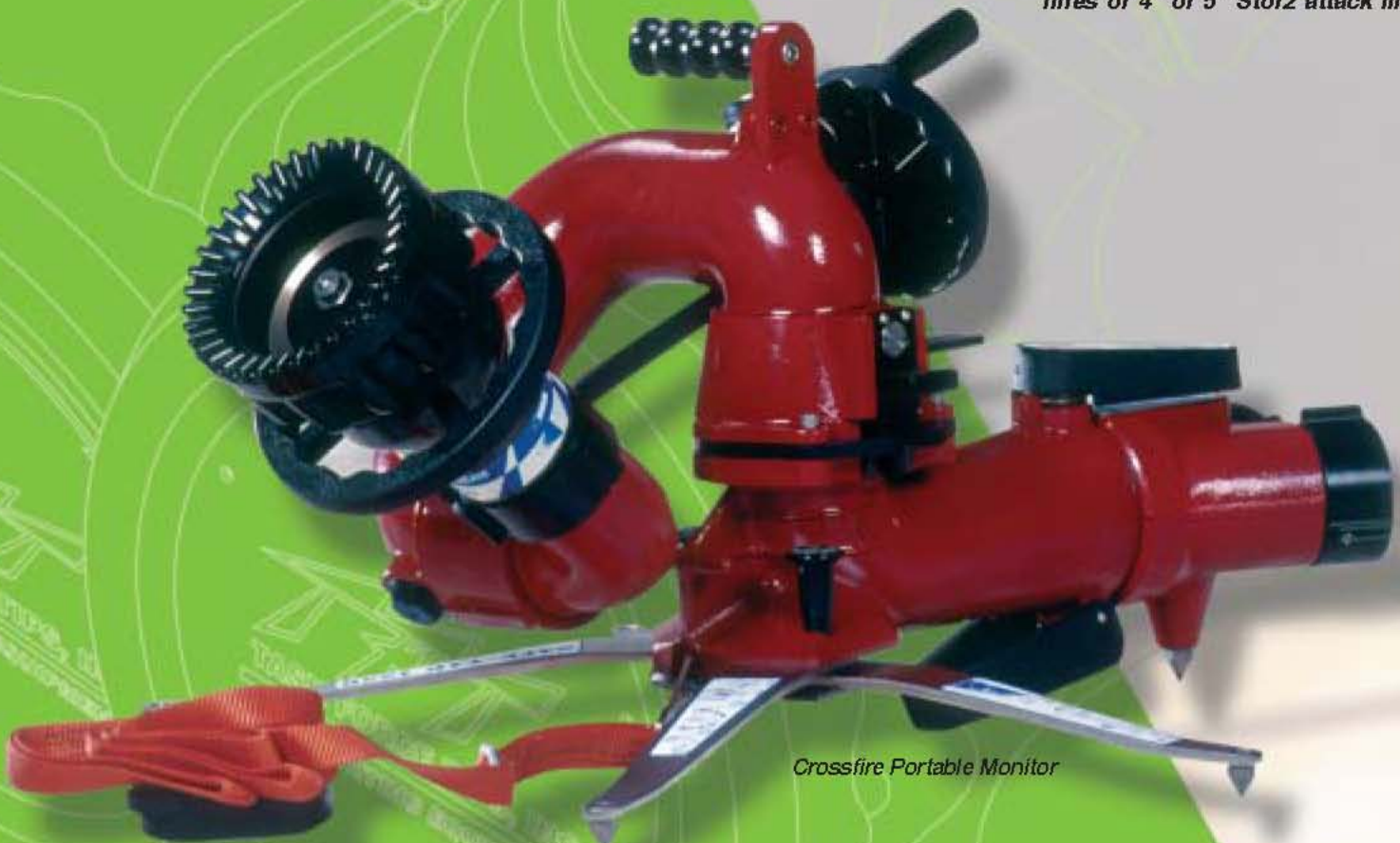
Crossfire Portable Monitor