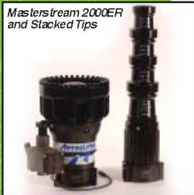
Mastersream 2000ER and Stacked Tips