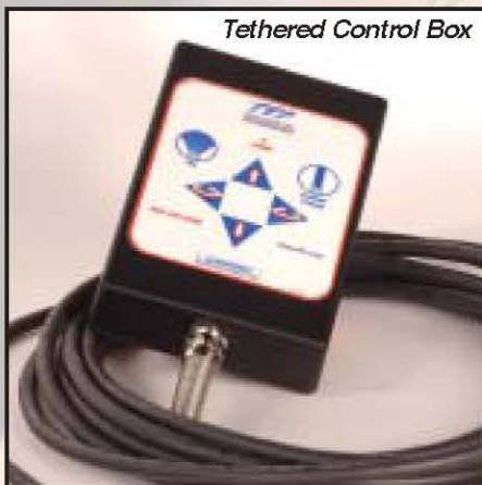
Tethered Control Box