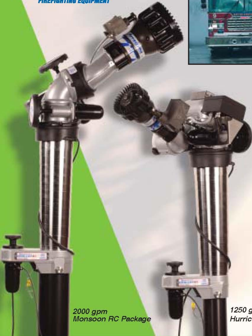
2000 gpm Monsoon RC Package