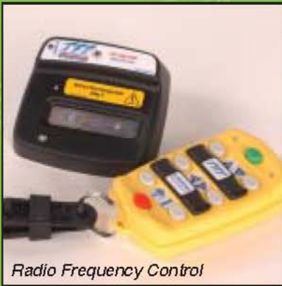
Radio Frequency Control