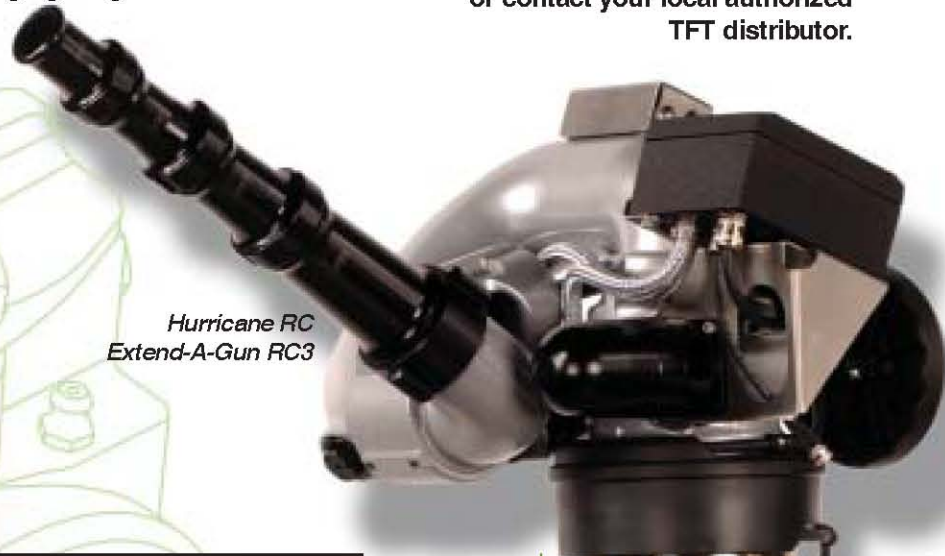
Hurricane RC Extend-A-Gun RC3

For additional information call 1-800-348-2686, visit www.tft.com or contact your local authorized TFT distributor.