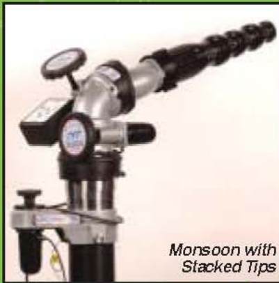
Monsoon with Stacked Tips