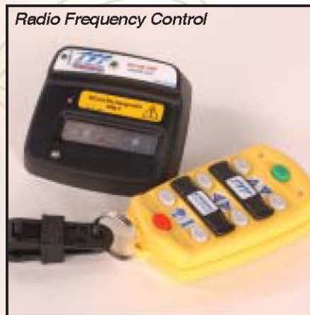
Radio Frequency Control