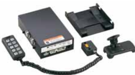
Pictured: 650 Series