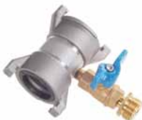
Pictured: Water Thief