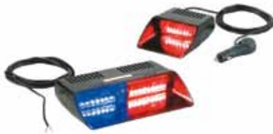
Pictured: Viper™ S2