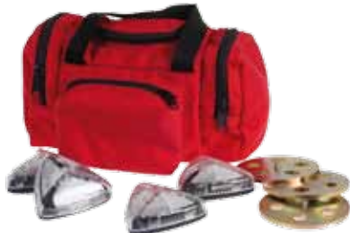
Pictured: Priority One Light Kits: