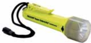
Pictured: TORCH - 2000 SabreLite™