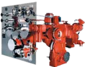
Pictured: Qflo Plus Single Stage Pump