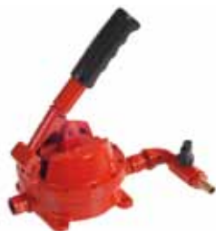
Pictured: Hand Primer