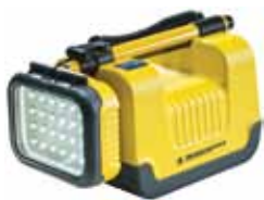
Pictured: REMOTE AREA LIGHT - 9430 RALS

GAAM is introducing a new range of safety equipment from Pelican, offering our customers an extensive choice of; Torch Lighting, Protective Cases and Area Lighting products.