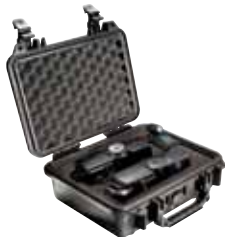
Pictured: SMALL CASE - 1200