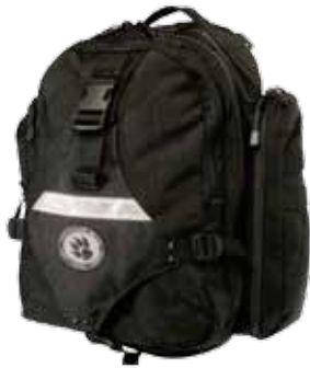
Pictured: 72 hour backpack