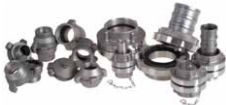
Pictured: Storz and QC Couplings