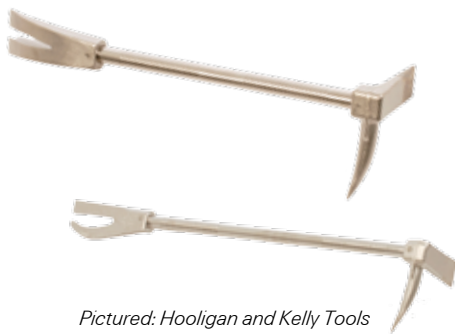
Pictured: Hooligan and Kelly Tools