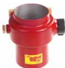
Pictured: Fire Hose Washer