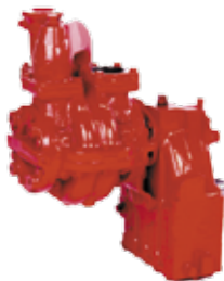
Pictured: CBP PTO Pump