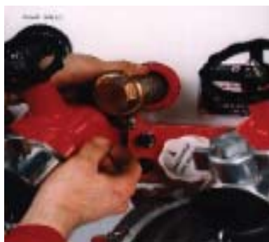
demonstration of product in use